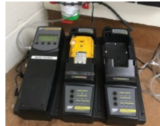
Auto Calibration and Bump Testing Gas Monitors